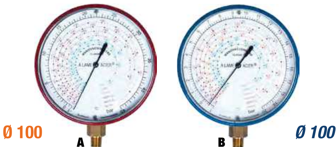
Manometro Blondelle Ø 100 - Att. radiale - Classe 1 Blondelle pressure gauge Ø 100 - Radial - 1 Cl.