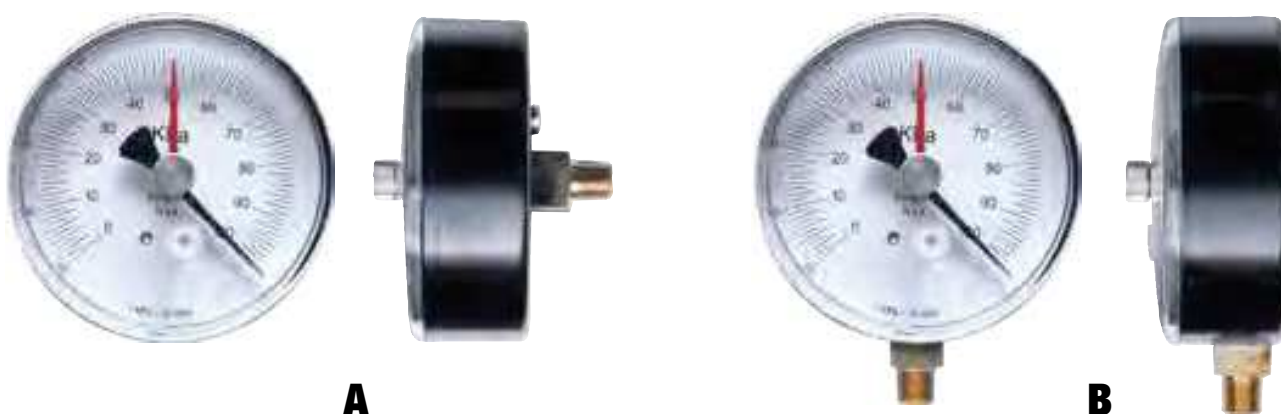
Manometro per vuoto ~ Vacuum gauge