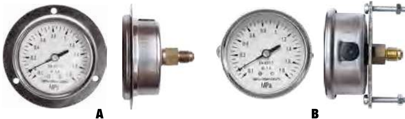
Manometro glicerina per controllo pressione olio Scala 0 - 18 bar Oil-filled gauge for oil pressure 0 - 18 bar range