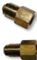
Riduzioni ~ Reductions