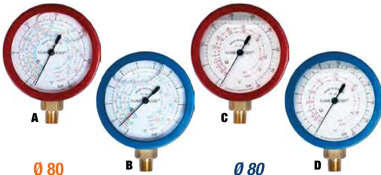
Manometro Blondelle Ø 80 - Glicerina - Att. radiale - Classe 1 Blondelle Oil-filled pressure gauge Ø 80 - Radial - 1 Cl.